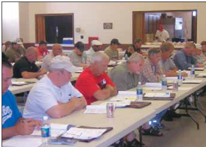
Seen here are attendees from Local Unions in Ohio and West Virginia at the shop steward class on June 21, 2008.

Some of the topics covered in the training session were: grievance preparation, Weingarten Rights, the Seven Test for Just Cause, discipline, Union's right to information and past practice.