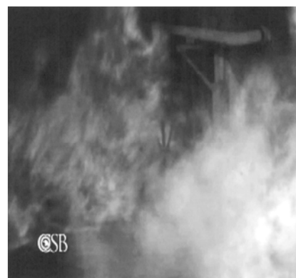
Figure 2. July 2009 hydrofluoric acid fire, explosion and release at the CITGO Corpus Christi Refinery.