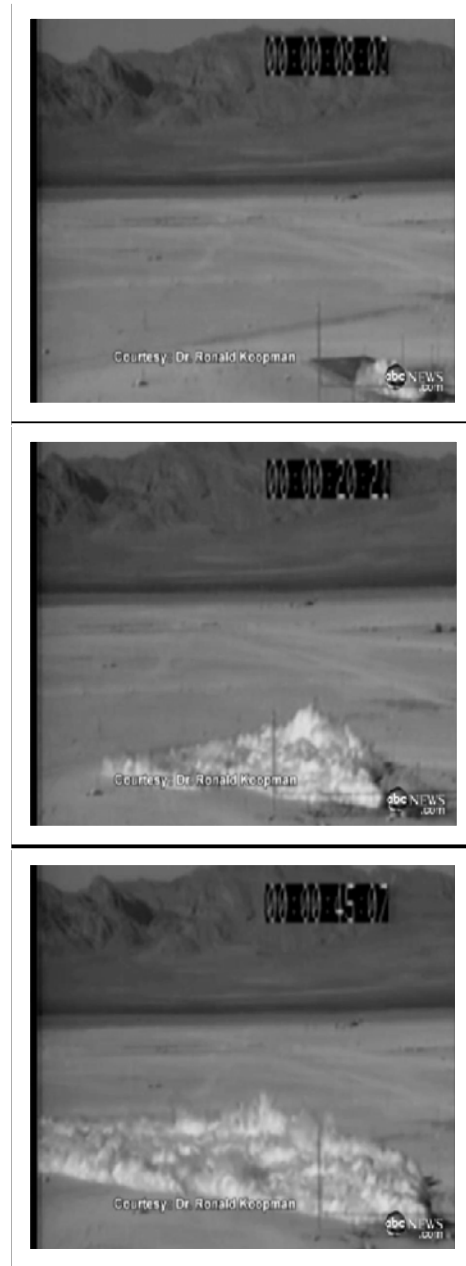
Figure 1. August 1986, an industry-sponsored controlled release of anhydrous hydrofluoric acid at a remote area of the Nevada Test Site. The seven minute test release created a hydrofluoric acid cloud over 10 feet high and visible from as far as \frac{3}{4} of a mile.

Scientific tests of HF releases conducted in 1986 in the Nevada desert surprised researchers when 100 percent of the released liquid HF formed dense, rolling clouds of toxic vapor (see sequence of photos in Figure 1). The clouds expanded rapidly and researchers measured dangerous concentrations at distances of three to six miles downwind. The tests showed that unless a refinery HF release is effectively mitigated it could place large numbers of refinery workers and large swaths of the surrounding communities in terrible danger. 2,3