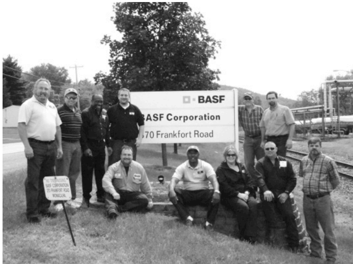
Photo (Left): While in Pittsburgh, Council members were able to tour the BASF plant in Monaca, PA.