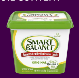
39% VEGETABLE OIL