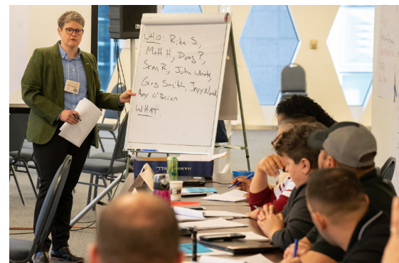
Training future Trainers in Pittsburgh to provide effective steward training.

Domestic violence is a workplace problem. Our union can support workers experiencing this trauma through our work at the bargaining table. As with most other things at the workplace, stewards are on the front lines and can recognize these situations before anyone else. So, let's step up and do our part.