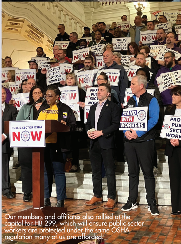
Our members and affiliates also rallied at the capitol for HB 299, which will ensure public sector workers are protected under the same OSHA regulation many of us are afforded.