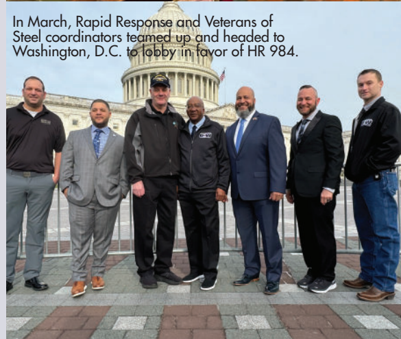
In March, Rapid Response and Veterans of Steel coordinators teamed up and headed to Washington, D.C. to lobby in favor of HR 984.