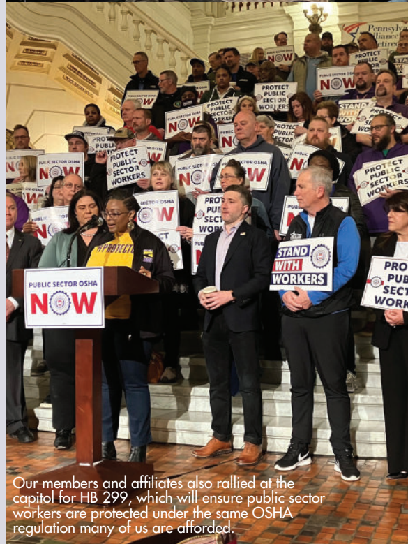
Our members and affiliates also rallied at the capitol for HB 299, which will ensure public sector workers are protected under the same OSHA regulation many of us are afforded.