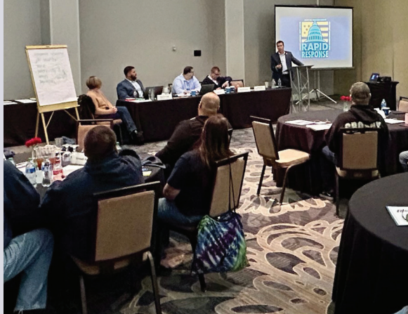
In January, we held a 3-day Rapid Response training at the Harrisburg Hilton.