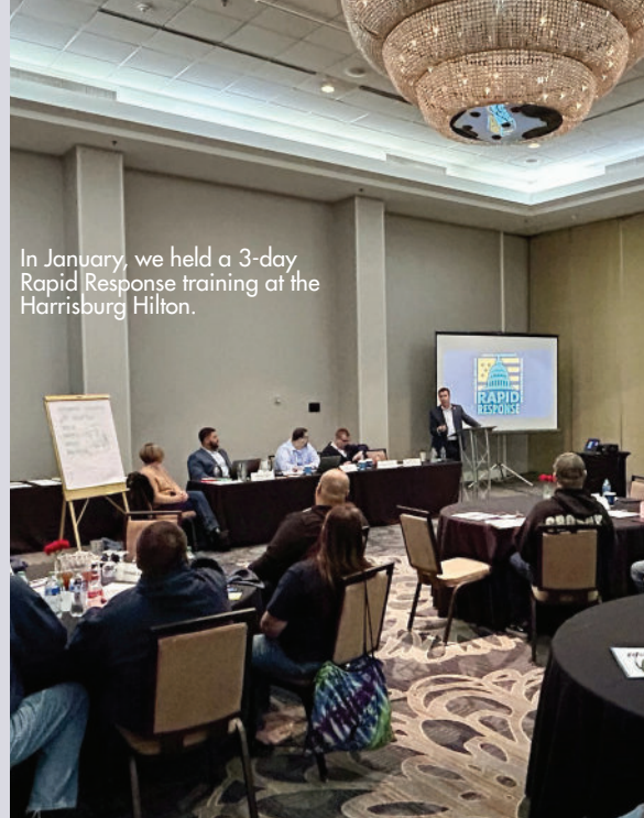
In January, we held a 3-day Rapid Response training at the Harrisburg Hilton.