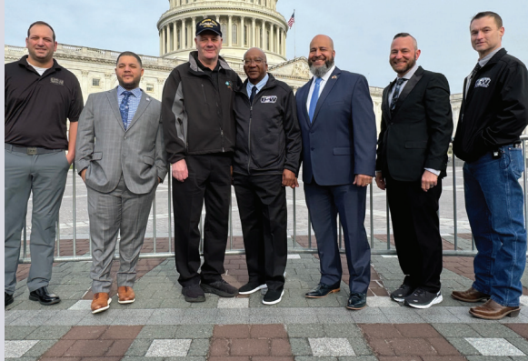
In March, Rapid Response and Veterans of Steel coordinators teamed up and headed to Washington, D.C. to lobby in favor of HR 984.