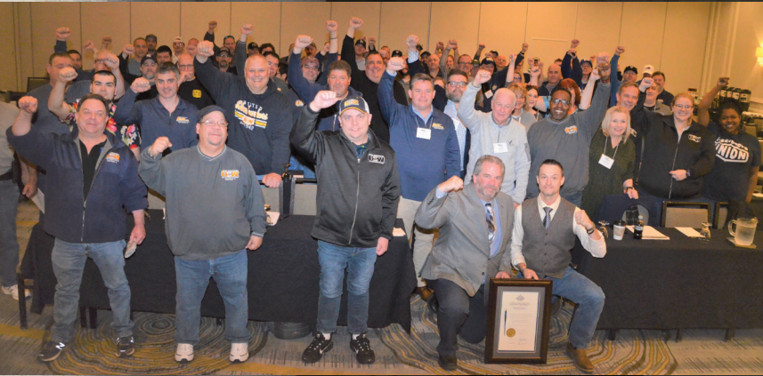
Delegates to the D4 Rapid Response Conference lobbying at the New York State Capitol in Albany, N.Y.