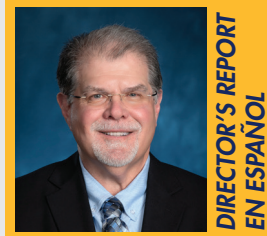
DIRECTOR'S REPORT EN ESPAÑOL

Para terminar, permítanme decir que ha sido un honor y un privilegio servir como Director del Distrito 4. Apreciaré los recuerdos de mi larga carrera y espero mantener las muchas amistades que he hecho en la Unión. No me iré por completo, ya que tengo la intención de permanecer activo en SOAR, así que espero verte en una de las próximas conferencias a las que pueda asistir. Ha sido un verdadero placer trabajar con cada uno de ustedes. Que Dios los bendiga y que Dios bendiga a los Trabajadores Siderúrgicos Unidos.