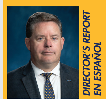
DIRECTOR'S REPORT EN ESPAÑOL

Para terminar, gracias a todos los que están leyendo esto: nuestros jubilados han abierto el camino que todos estamos caminando ahora, nuestros líderes sindicales locales que están en primera línea todos los días y, sobre todo, a los miembros de nuestra gran Unión que van a trabajar todos los días, mantienen a sus familias, y son la columna vertebral de esta gran Unión! Es el honor de mi vida servirles como Director del Distrito 4 de la USW, y haré todo lo posible para estar a la altura de la responsabilidad que me han dado.