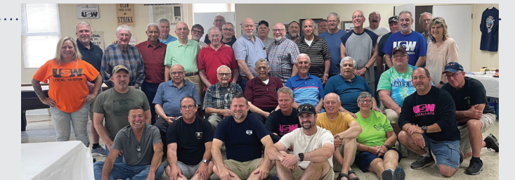
Members of Local 10-0729 and their SOAR chapter at the recent luncheon.

Also, I would like to give a special thanks to the locals that participated in the Rapid Response Conference in Washington, D.C., which was accompanied by an action of community service. Locals attending the conference spent time preparing for the distribution of household products that were donated and will be provided to a variety of shelters.