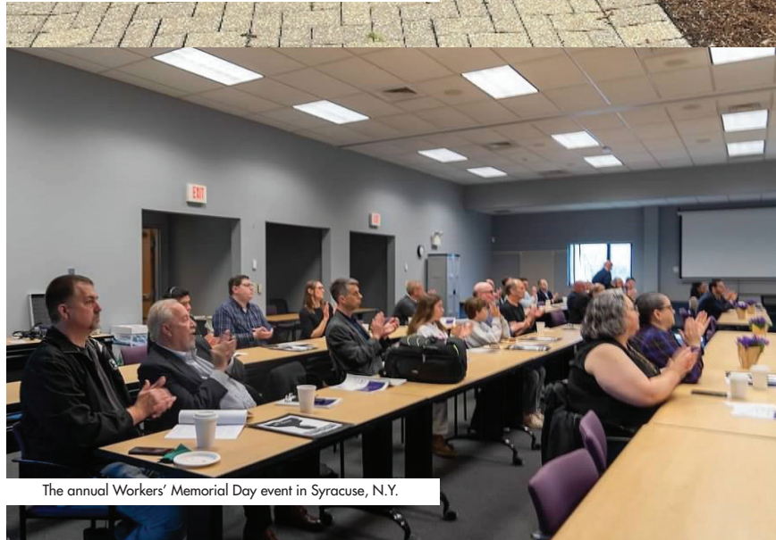
The annual Workers' Memorial Day event in Syracuse, N.Y.