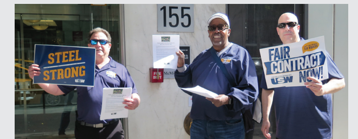
V'Soske Leaflet Action.