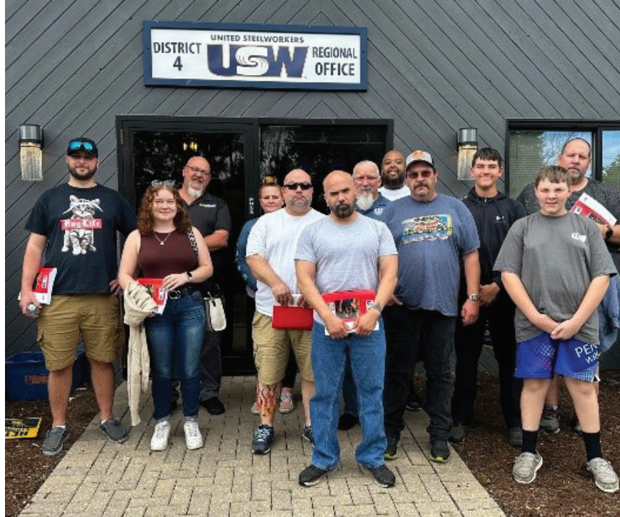
OSHA 10-Hour training at the training center in Syracuse, N.Y.

Big thanks to all of the locals that continue to see safety training as an important part of their job!