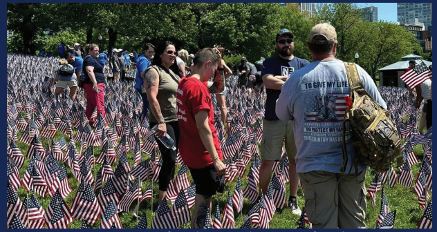
NextGen (N), Women of Steel (W), and Veterans of Steel (V) members from Locals 12003 and 12013 joined forces to place flags on Boston Common.

District 4 is also excited to host its 4th Veterans Council Meeting on July 11 at the Crowne Plaza – Desmond Hotel in Albany. This meeting is a platform for sharing insights and strategies to support veterans.