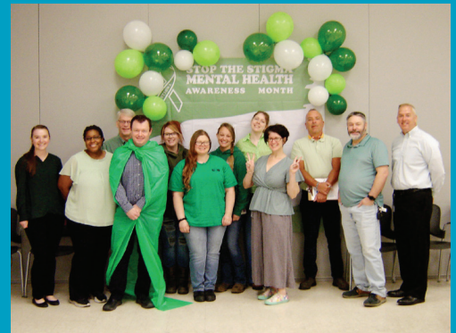
In honor of Mental Health Awareness Month, Local 1000 WOS held a Mental Health Awareness Day May 15. Participants wore green to combat the negative stigma associated with mental health and to promote self-care.