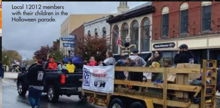
Local 12012 members with their children in the Halloween parade.