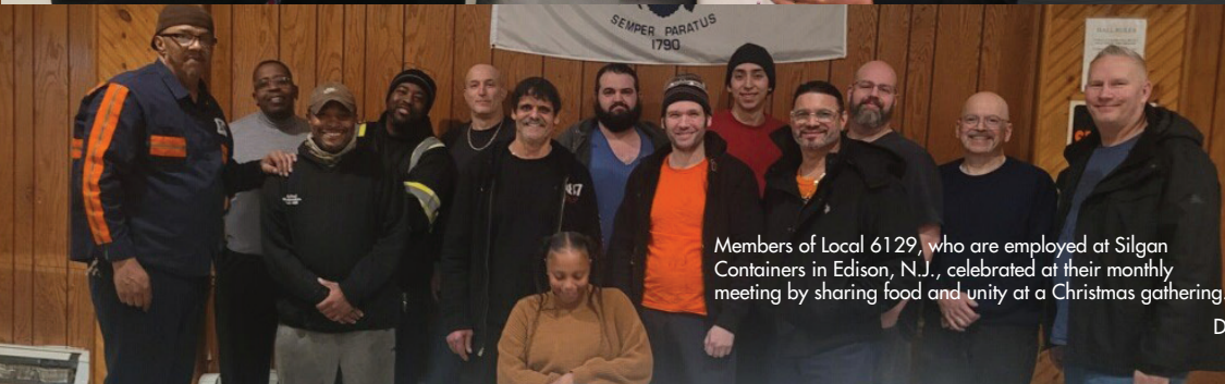
Members of Local 6129, who are employed at Silgan Containers in Edison, N.J., celebrated at their monthly meeting by sharing food and unity at a Christmas gathering.