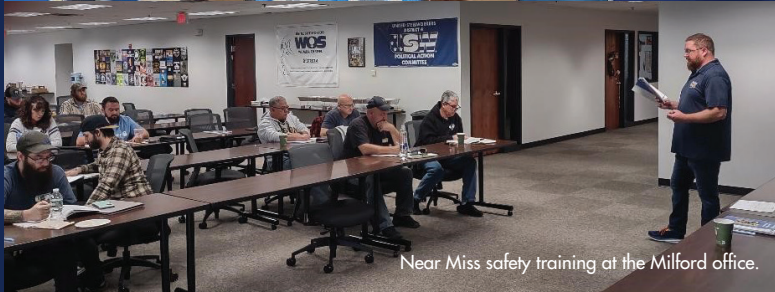
Near Miss safety training at the Milford office.