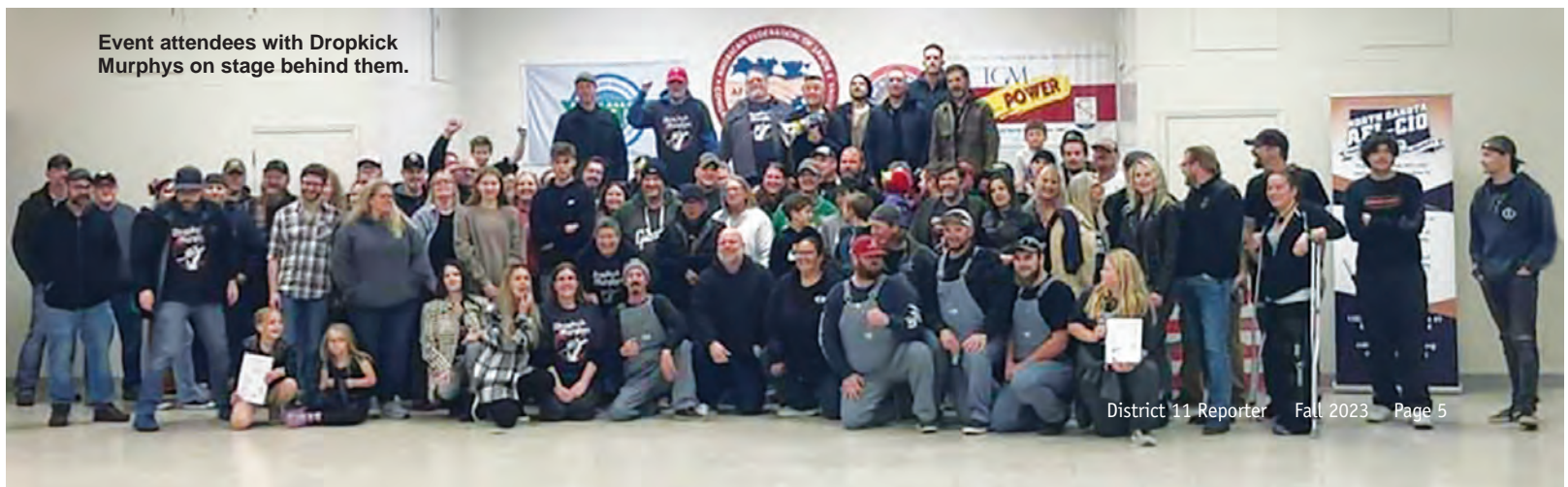
Event attendees with Dropkick Murphys on stage behind them.